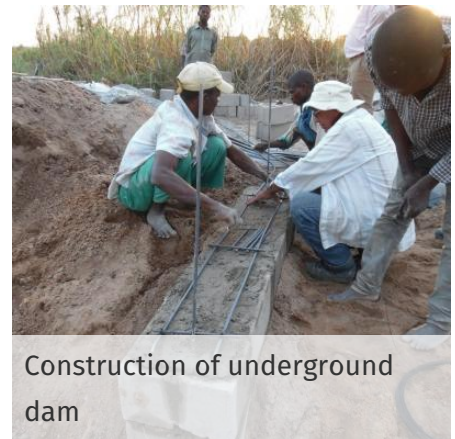
Construction of underground dam