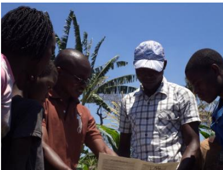
Training on basic irrigation solutions