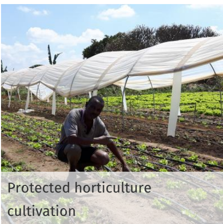
Protected horticulture cultivation