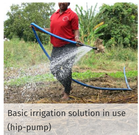
Basic irrigation solution in use (hip-pump)