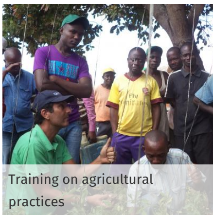
Training on agricultural practices