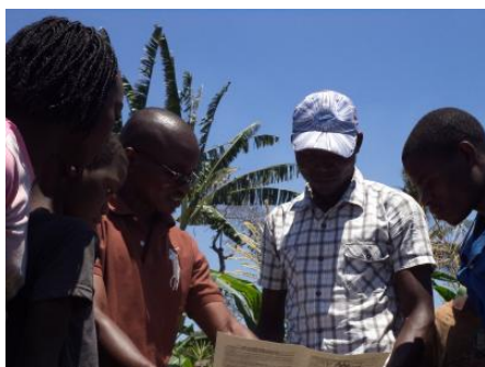
Training on basic irrigation solutions