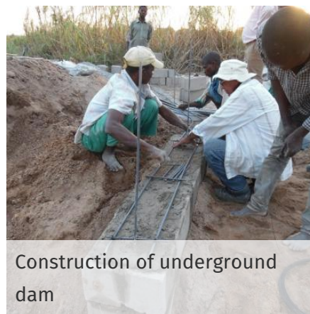
Construction of underground dam