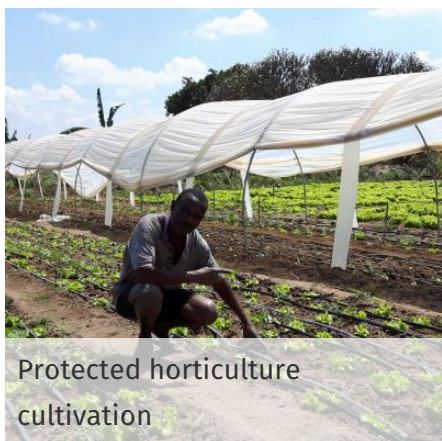
Protected horticulture cultivation