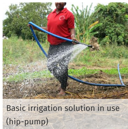
Basic irrigation solution in use (hip-pump)